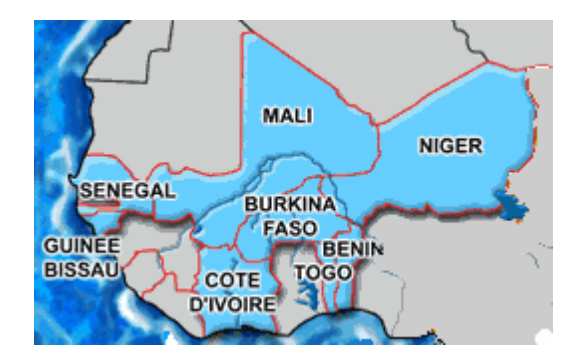
Figure 1: The West African Economic and Monetary Union

Roads is the main transportation infrastructure used for intra-regional trade (more than 90%<sup>9</sup>). The road network of the Union is 146,352 km long with only 14% paved. This network is unevenly distributed among members and is integrated in the whole West African roads network, which comprises three types of roads: the coastal roads linking coastal countries, the corridors linking landlocked countries to the sea, and the trans-sahel road from the border between Niger and Chad to Senegal. The coastal countries, representing 20% of the Union surface area, concentrate more than 70% of the Union roads. Table 2 below shows the road network distribution within the Union: