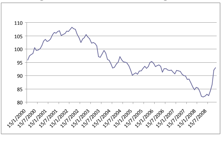
Figure 1 – US real effective exchange rate